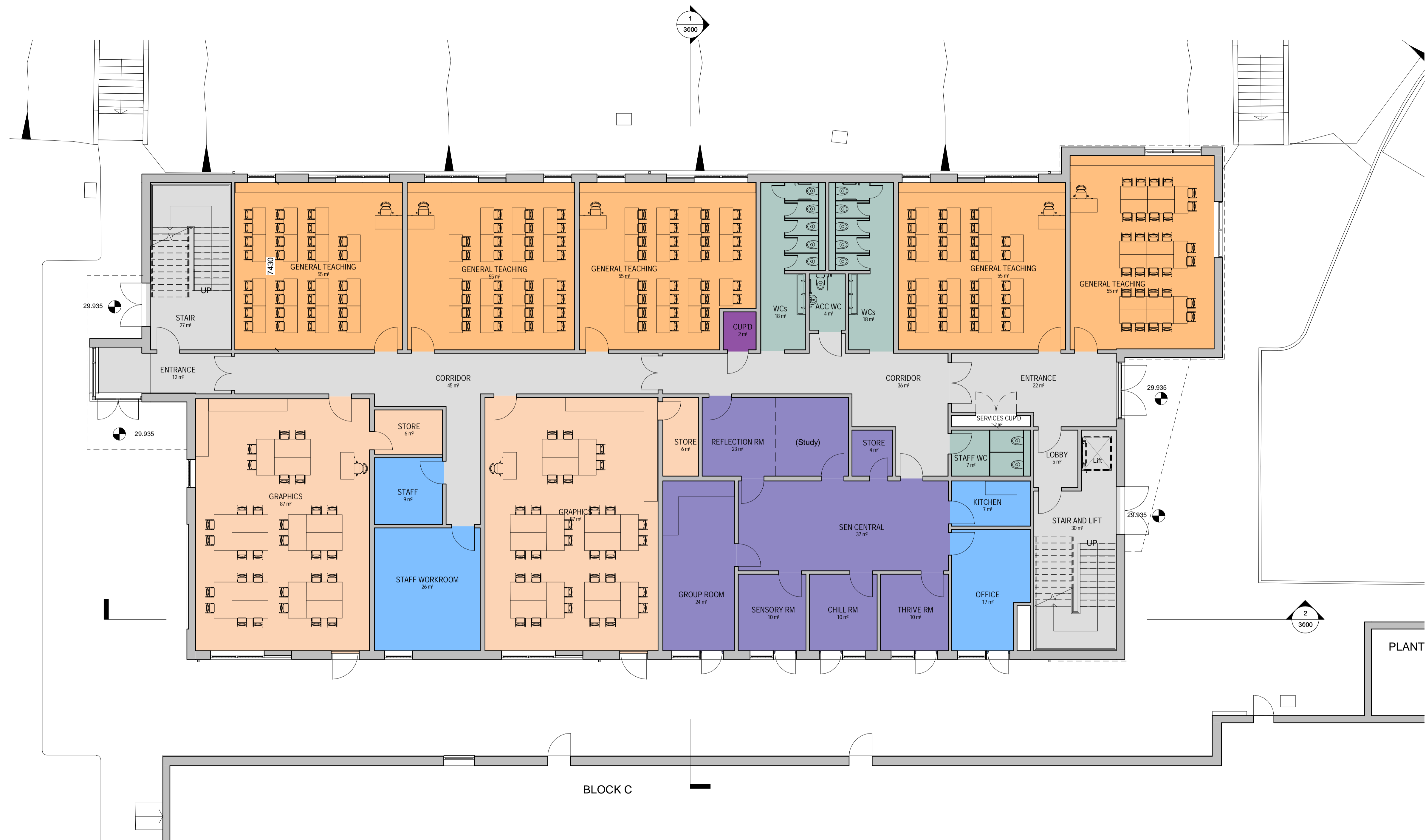
Ground Floor GA Plan 1 : 100

Note: Do not scale this drawing. All levels and dimensions are to be checked on site. This drawing is to be read in conjunction with all relevant consultants' requirements, drawings and specifications. Any discrepancies between consultants' drawings to be reported to the Contract Administrator before any relevant work commences.